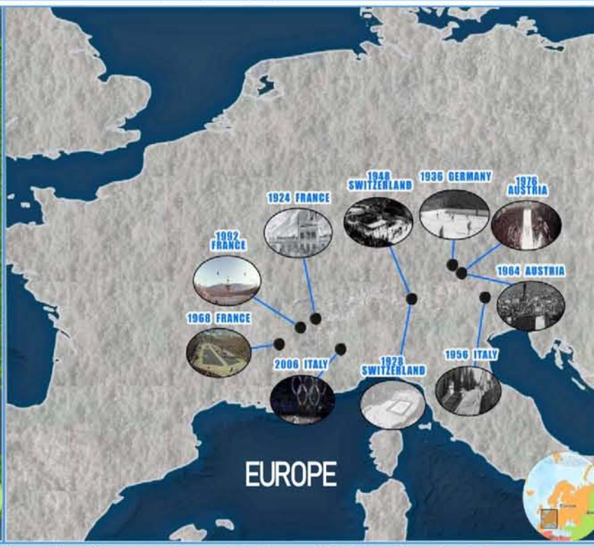
Above maps focused on the Major Olympic hosted locations in European Countries. A) Summer Olympics in Europe B) Winter Olympics in Europe

The Olympic motto is the hendiatis Citius, Altius, Fortius, which is Latin for "faster, higher, stronger". The Olympic symbol, better known as the Olympic rings and represents the Unity of the five inhabited continents (Africa, America, Asia, Australia, Europe).